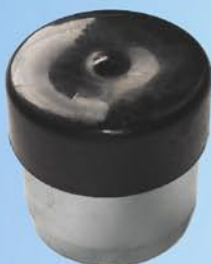
JS-BUDY Bearing Buddy