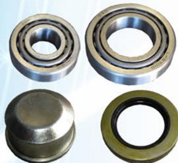
JS-BLMSET Bearing Accessories Set LM Bearings 11910/49 and 67010/48, oil seal, dust cap JS-BLSLSET Bearing Accessories Set SL Bearings 12710/49 and 68110/49, oil seal, dust cap