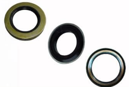
JS-OS-LM Oil Seal suit LM JS-OS-SL Oil Seal suit SL JS-OS-LMM Oil Seal Marine LM JS-OS-SLM Oil Seal Marine SL JS-OS-DX Oil Seal Dexter