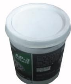
JS-GRS2 Grease 2kg JS-GRS3 Grease 3kg JS-GRS5 Grease 5kg JS-GRS18 Grease 18kg