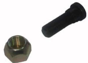
JS-WSD-F Wheel Stud Ford 1/2" JS-WNT-F Wheel Nut Ford 1/2" JS-WSD-H Wheel Stud Holden 7/16" JS-WNT-H Wheel Nut Holden 7/16" JS-WSD-L Wheel Stud Landcruiser 5/8" JS-WNT-L Wheel Nut Landcruiser 5/8"