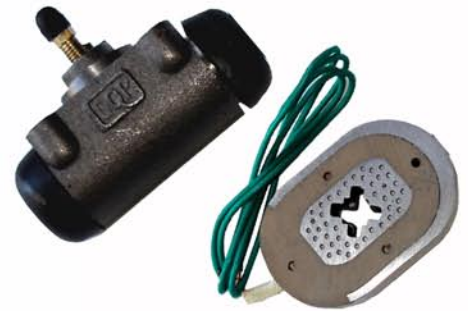
JS-HYDCL Hydraulic Backing Plate Cylinder JS-EBKMG Electric Backing Plate Magnet