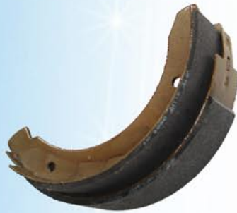
JS-BSEL Brake Shoes Pair suit Electric JS-BSHY Brake Shoes Pair suit Hydraulic JS-BSMC Brake Shoes Pair suit Mechanical