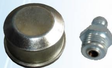
JS-DCAP Dust Cap JS-DCAP-D Dust Cap for Dexter JS-GNIP Grease nipple