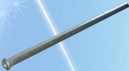
JS-BND2.4 Bundy Tube 2.4 Mt JS-BND3.0 Bundy Tube 3.0 Mt JS-BND3.5 Bundy Tube 3.5 Mt JS-BND450 Bundy Tube 450mm JS-BND26 Bundy Tube Roll 26 Mt.