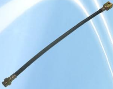
JS-BHOSE Brake Hose JS-BHOSE-F Brake Hose fitted T Piece JS-BHOSE-T Brake Hose T Piece