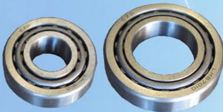
JS-BSLM Bearing Set LM Bearings 11910/49 and 67010/48 JS-BSSL Bearing Set SL Bearings 12710/49 and 68110/49